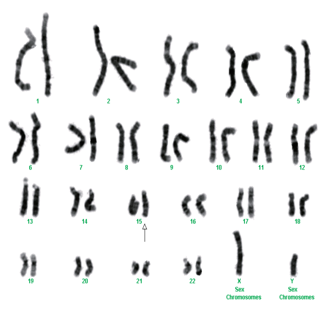
Fig. 1. Partial karyotype of the case showing deleted chromosome 15.

located in 15q22, leaving both D15Z1 and SNRPN gene signals intact. The latter ones locate in 15p11.2 and 15q11q13, respectively. These FISH findings confirm that the deleted regions contain at least 15q22. The chromosome analysis was written as 46, XY,del(15)(q22q23) (Figs. 1, 2). Parental chromosomes were